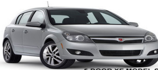
5-DOOR XE MODEL SHOWN

Auto Sponsored by Saturn of Columbus, Ohio 2009 Saturn Sports Coupe www.saturnofcolumbus.com